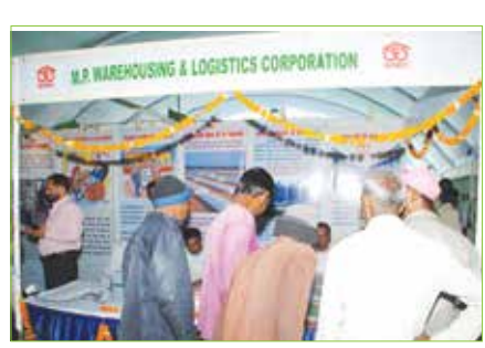
M.P. Warehousing & Logistics Corporation