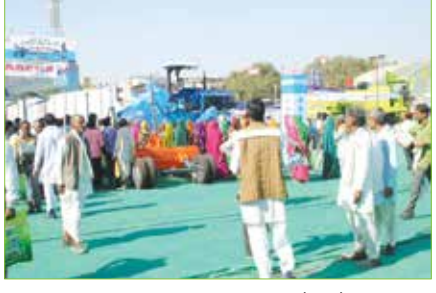
Apogee Precision Lasers (APL)