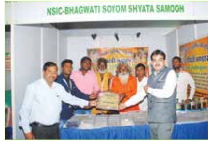
NSIC- Bhagwati Soyom Shyata Samooh