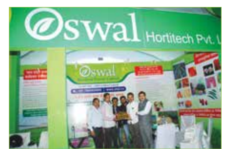
Oswal Horitech Pvt. Ltd.