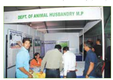
Dept. of Animal Husbandry M.P.