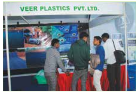
Veer Plastics Pvt. Ltd.