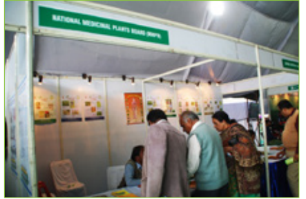
National Medicinal Plants Board (NMPB)