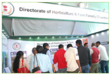
Directorate of Horticulture & Farm Forestry Chattisgarh, Raipur